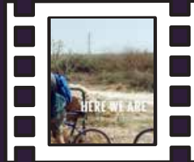
Here We Are Wednesday, March 3 7:00 PM