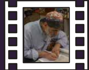
Commandment 613 Thursday, March 4 1:00 PM