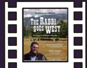
The Rabbi Goes West Thursday, March 11 1:00 PM