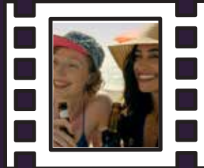
Kiss Me Kosher Sunday, February 28 7:00 PM