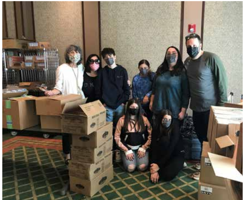
Backpack Buddies hard at work for the kids!