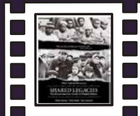
Shared Legacies Tuesday, March 9 7:00 PM