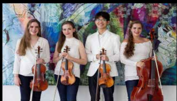
Stamps String Quartet at Mickve Israel

Congregation Mickve Israel 20 E Gordon St Savannah, GA 31401