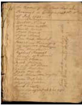
Page from Sheftall Diaries listing Georgia's original Jewish settlers