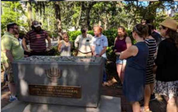
Our visiting Rabbinical students enjoyed their time in Savannah learning about the history of the Jews